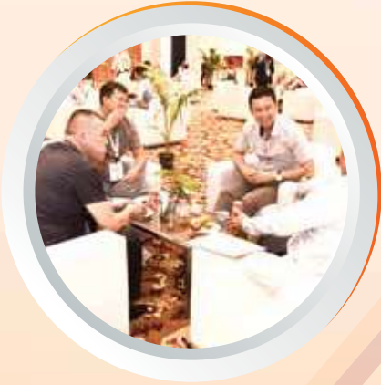
B2B sector presentation and roundtable meetings