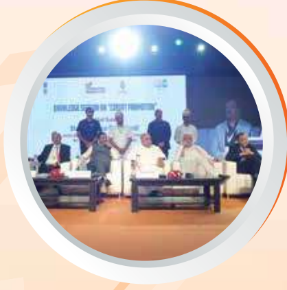
Knowledge Sessions, Seminars, Conclaves