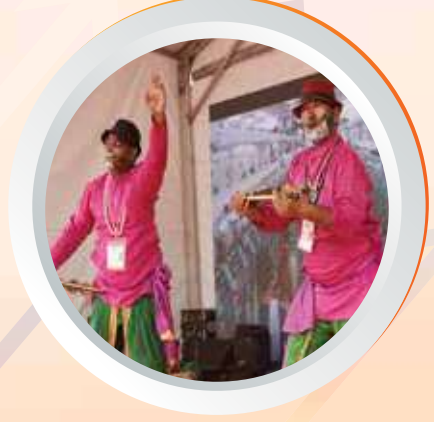
Cultural Performances (Folk & Classical)