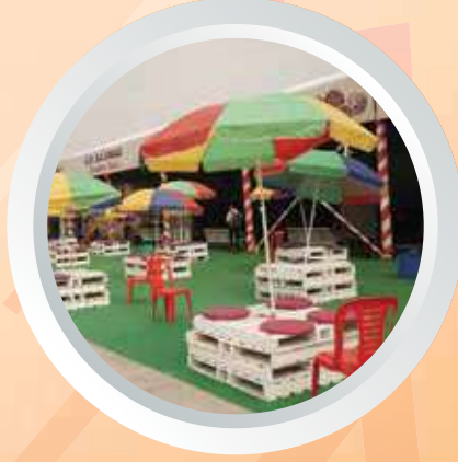
UP Ka Swad (Cuisine and Culinary Arts)