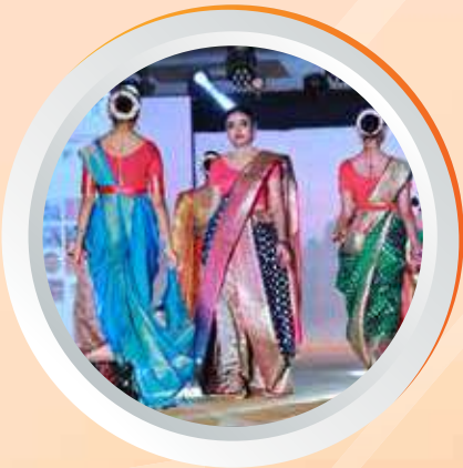
Fashion Shows and Band Performances