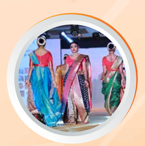
Fashion Shows and Band Performances