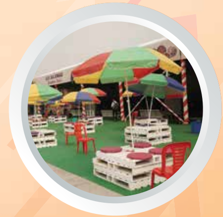
UP Ka Swad (Cuisine and Culinary Arts)